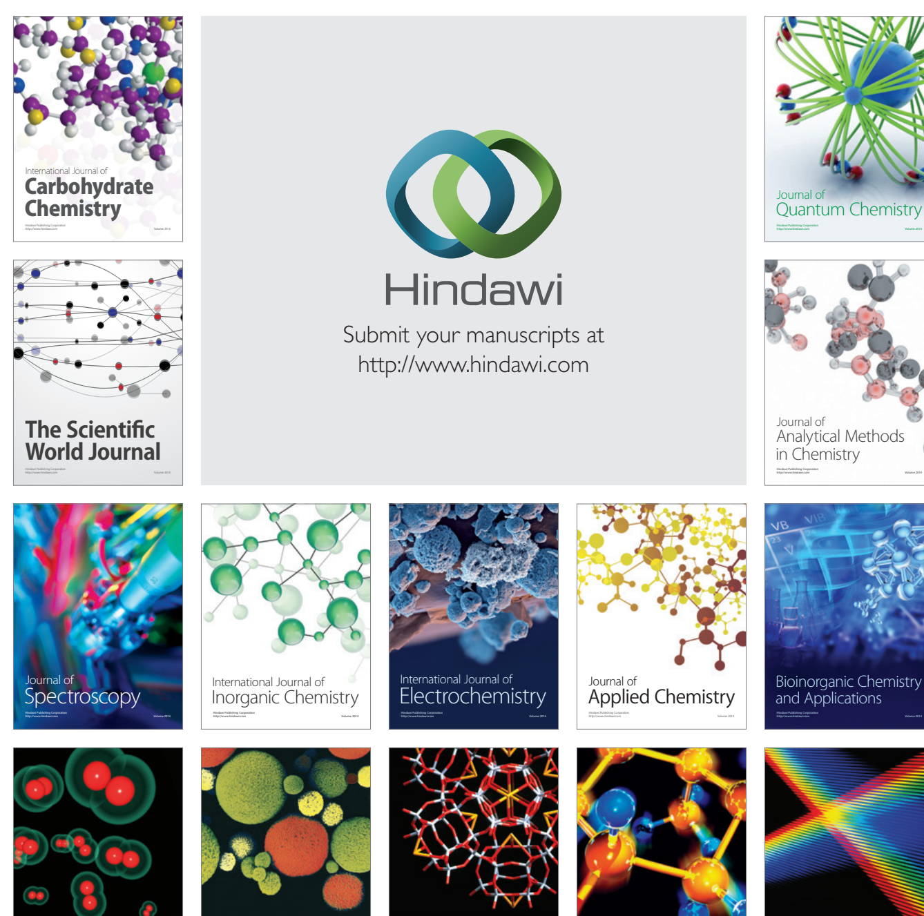
Chromatography Research International